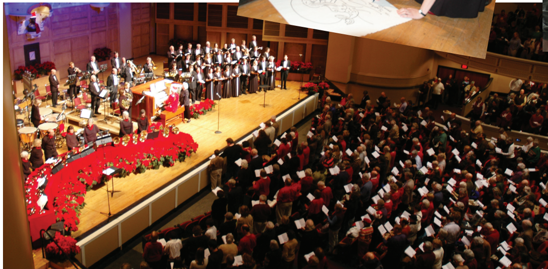
NEAR CAPACITY AUDIENCES HAVE ENJOYED "CHRISTMAS WITH CORNILS" CONCERTS SINCE THEIR INCEPTION 20 YEARS AGO. THIS PHOTO IS FROM 2009. THE 2011 VERSION WILL BE ON TUESDAY, DECEMBER 20. CALL PORTTIX AT 842-0800 FOR RESERVATIONS.