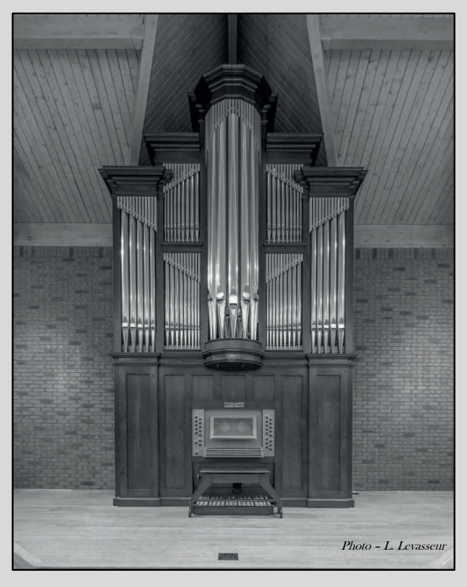
Wallace & Co. op 78, 2018 - Ancaster, ON, Canada